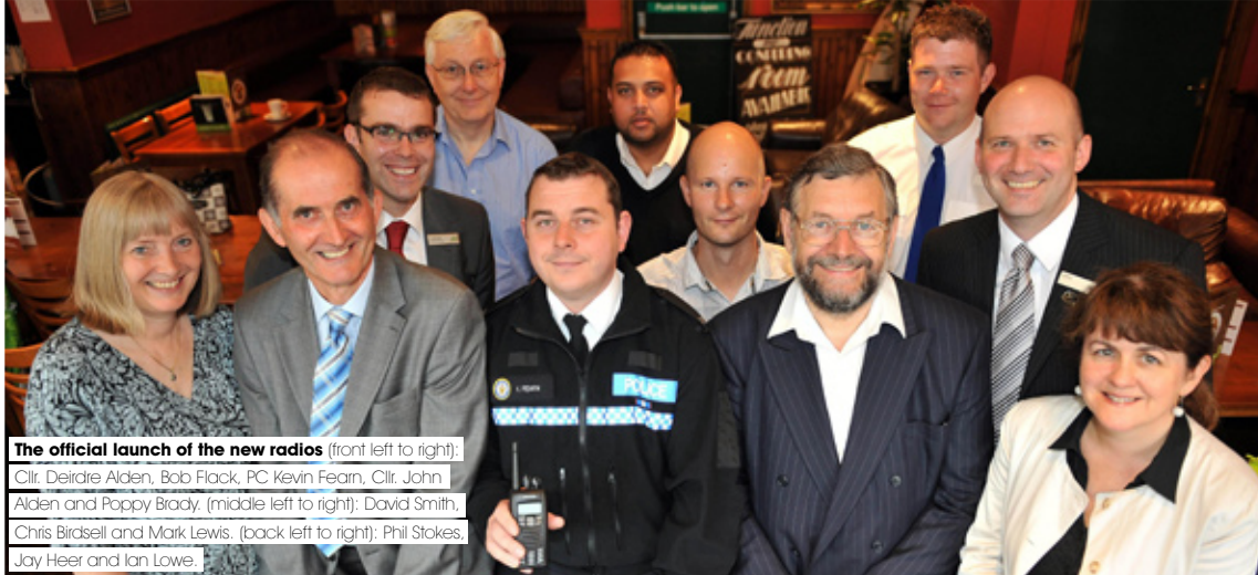
The official launch of the new radios (front left to right):

Shoppers beware! New measures have been introduced at stores on Harborne High Street to tackle crime.