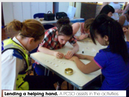
Lending a helping hand. A PCSO assists in the activities.