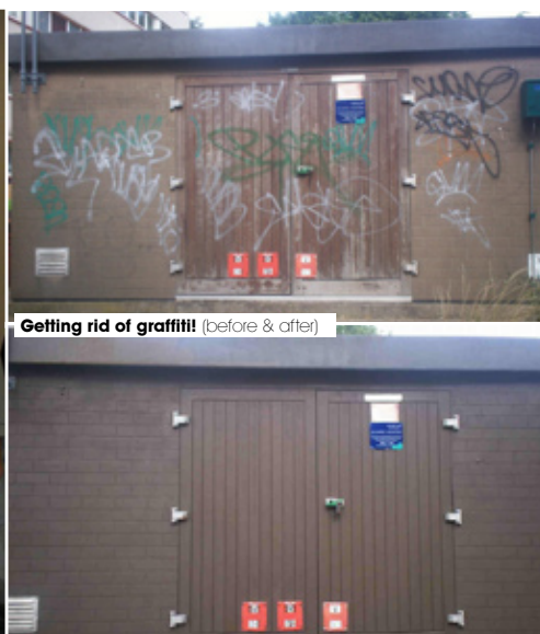
Getting rid of graffiti! (before & after)