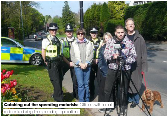
Catching out the speeding motorists: Officers with local residents during the speeding operation.